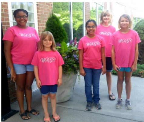
ABOVE: Singers share with the Special Children's Center in July; BELOW: Sharing Concert concluding our Summer Sing Day-Camp in early August.