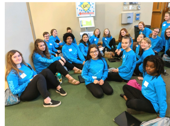
Above: WSGC girls take a break during festival rehearsals.