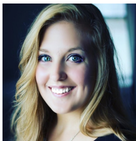
Soprano Caryn Crozier