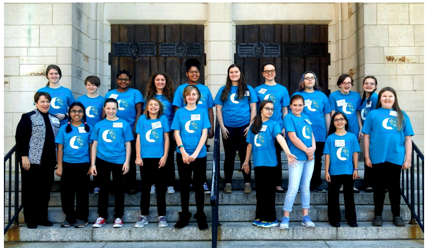
Above: WSGC Singers pose at the Piedmont Festival